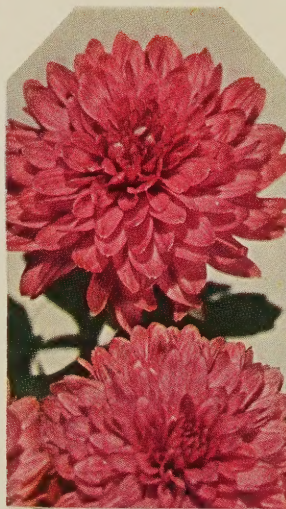
VIOLET. 50c each; 3 for $1.25

7 Earliest MUMS All bloom in late August and early September 7 Sure-to-Bloom Plants $3.25 (1 of each pictured)